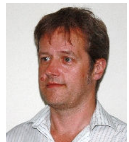
Article by Dave Atkinson

We should be clear from the outset that this transformation will take time and investment. At the present time, we do not have a workforce who are equipped to deliver all the elements of the model. In no way should that be an argument not to press ahead with its implementation however strategic policy planners need to be clear from the outset that this programme will require a sustained, long term commitment.